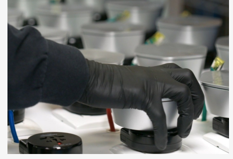
Plume – Software flashing, test and fulfillment for wireless signal boost devices