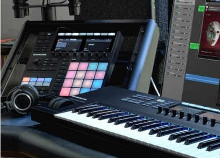
Native Instruments – Digital music hardware testing, configuration, and B2B / B2C fulfillment