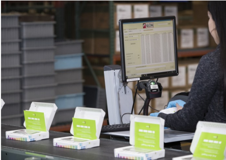
23andMe – Genetic/medical DNA collection kit inventory, kitting, omni-channel fulfillment