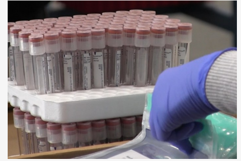
Color – Medical test kit assembly and distribution