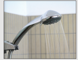
Water flow fixtures