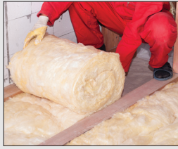
Insulation and weatherization