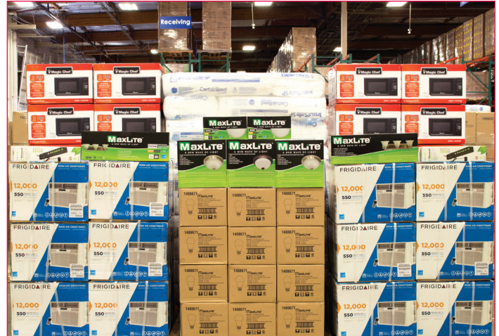
Best-practices in procurement, inventory and order management assure complete order delivery direct to installation contractor.