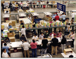
Kitting and assembly

Our clients work collaboratively with a dedicated ALOM strategic account manager to outsource all, or substantial parts of their global operations where we seamlessly manage both the product supply chain and marketing operations of their business-critical programs.