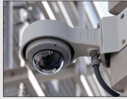
Secure inventory control