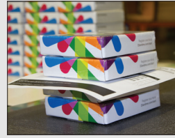
E-commerce global fulfillment