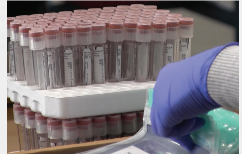
Color – Medical test kit assembly and distribution