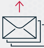
Print and Mailing Services