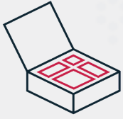
Kitting and Assembly